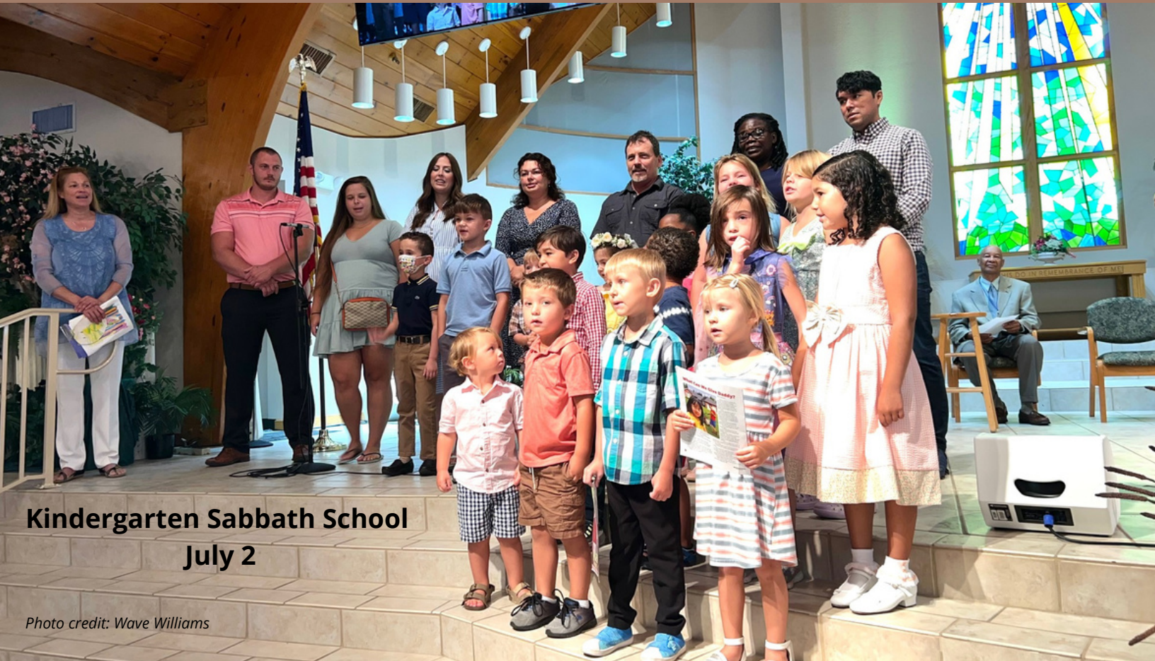
Kindergarten Sabbath School July 2